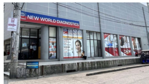
Sta. Rosa City, Laguna