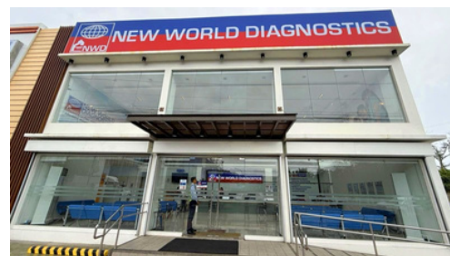
Lipa City, Batangas