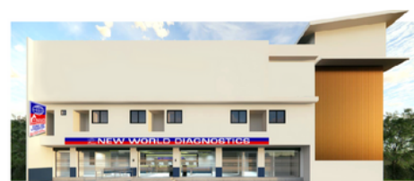
LUCENA BRANCH Merchan St., Lucena City, Quezon Province

More accredited facilities will be announced in the coming weeks. If you wish to request accreditation of your preferred facility or physician, you may visit metrocarehealth.com/accreditation or contact us through the details provided in this newsletter.