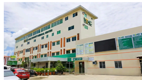
Above: Holy Trinity Hospital of Tarlac City, Inc.