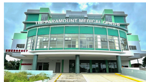
Above: The Paramount Medical Center near LIMA in Batangas

More accredited facilities will be announced in the coming weeks. If you wish to request accreditation of your preferred facility or physician, you may visit metrocarehealth.com/accreditation or contact us through the details provided in this newsletter.