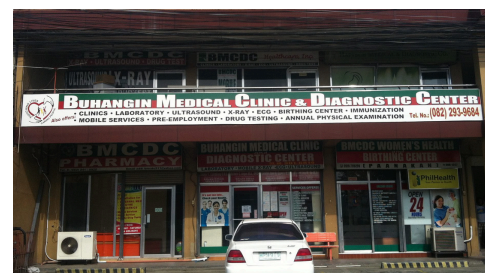
Above: Buhangin Medical Clinic and Diagnostic Center in Davao